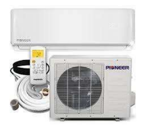
Mini Split Heat and AC Pump

A6: A mini-split is a three-in-one system that will allow for heat, fan only, and Air conditioning. This is an all-electric unit and will require a 30 to 50-amp service to properly operate.