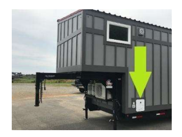
Gas/LP Water Heater Location

A9: Typically, your on-demand hot water heaters are located near the front driver's side, tongue box, however sometimes they can be located towards the mid-point or rear of a unit. Please consult Tiny Heirloom for your specific unit so that you know where it is located.