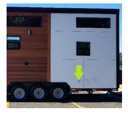
Power Inlet Location