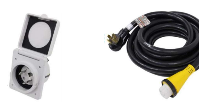
Power Inlet Power Cord

A1: We will supply you with a standard 30- or 50-amp RV power cord. This cord will be the lifeline that connects the Tiny Home RV/Travel Trailer to a power source. All Tiny Home RV/Travel Trailer will have a covered service outlet located on the rear driver side of the unit with the required amperage clearly marked. The power cord should ideally be plugged into a designated outlet of the appropriate amperage, but an adaptor for a standard wall outlet is also available. Some circuits may not function if the unit is not plugged into an appropriate outlet.